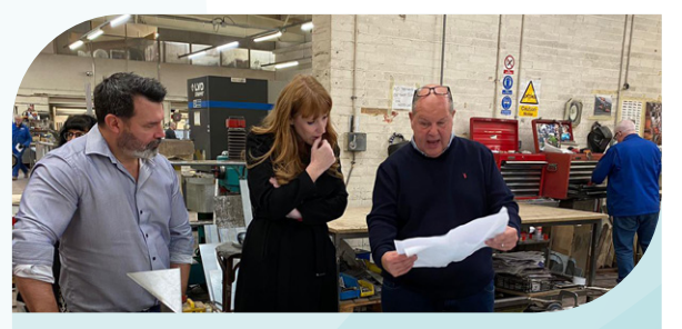
Deputy Leader of the Labour Party Angela Rayner MP , meets Goyt Kitchen Fabrications backed by the Development Bank of Wales, in her constituency Ashton-under-Lyne